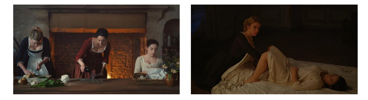
Image: Sciamma has quoted French memoirist <u>Annie Ernaux</u>, who says, "I don't believe there is a single museum in the world whose collections feature a work called The Abortionist's Studio ." I.e., how is this widespread and longstanding practice still so taboo in all artistic traditions, including that of cinema? What if we take this image as Portrait 's centerpiece?